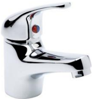
1/2" Single Lever Basin Mixer c/w PUW