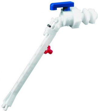
PVC Ballvalve Side Supply