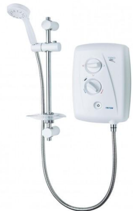
Code: MIRAJUMP (Mains)