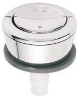
Dual Push Button CP