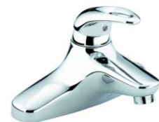
Rio Single Lever Bath Filler