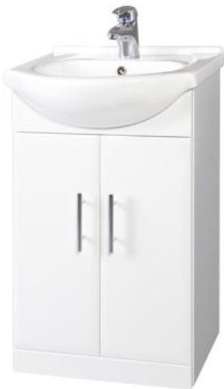
Kinsale 55cm Vanity Unit & Sink