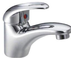
1/2" Rio Single Lever Basin Mixer c/w PUW