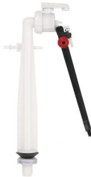
PVC Ballvalve Bottom Supply