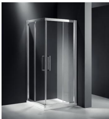
Corner Entry Door