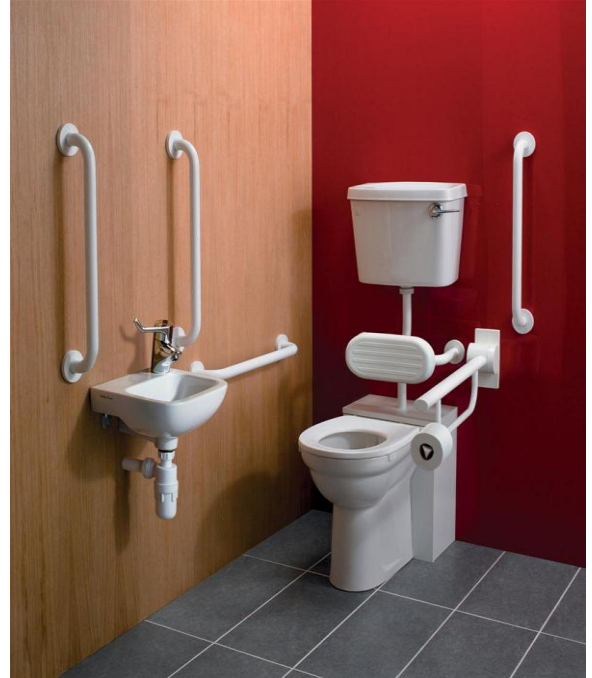
Doc M Low Level WC Pack c/w White Rails