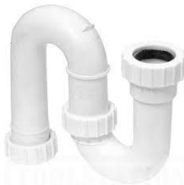
S - Trap 1 ¼" & 1 ½"