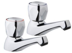
3/4" Contract Bath Taps