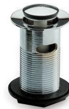
Pop Up Waste