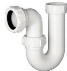
P - Trap 1 ¼" & 1 ½"