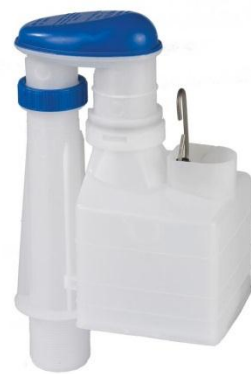
Square Internal Syphon