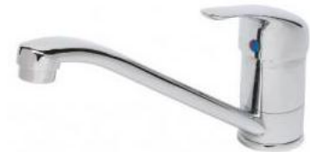
1/2" Single Lever Basin Mixer c/w Waste