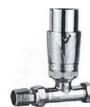
Style S5-1 Straight TRV Chrome