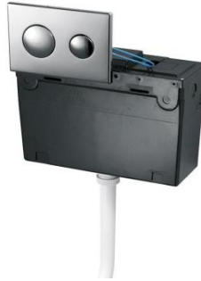
Conceala 2 Pneumatic Dual Flush Cistern, Internal Overflow Top Inlet.