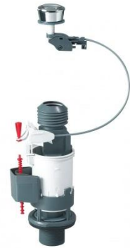
Jollyflush Dual Syphon Kit