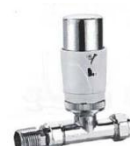
Style S4-1 Straight TRV Chrome/White