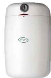
Code: PUSWH10 & PUWSH15