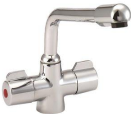
1/2" Quarter Turn Sink Mixer