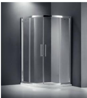
Offset Quadrant Door

Available in 1000mm x 800mm 1200mm x 800mm/ 1200mm x 900mm