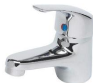
1/2" Single Lever Basin Mixer c/w Waste