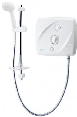
Code: T90XR (Tank)