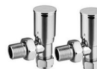
Titan Rad Valve CP