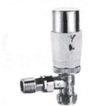
Style S4 TRV Chrome/White