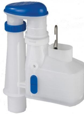
Oblong Internal Syphon