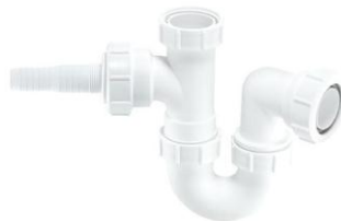
Sink Trap c/w 1 conn