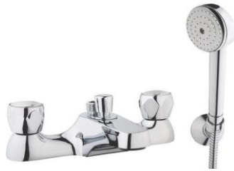
3/4" Contract Bath/Shower Mixer