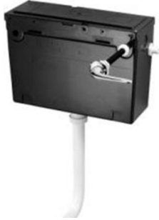
Conceala 2 Single Flush Side Supply, Internal Overflow c/w Lever