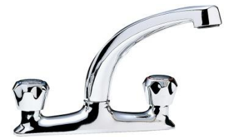
1/2" Dual Flow Sink Mixer