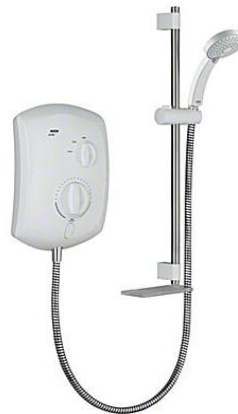
Code: T80Z (Mains)