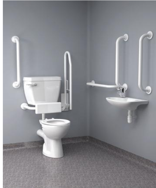
Doc M Low Level WC Pack c/w White Rails