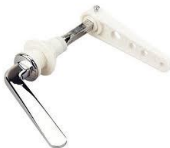
Chrome Cistern Lever