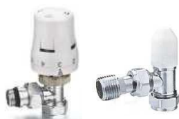
STYLE S1 & LS