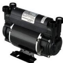
Showermate Contract Twin Impellor Pumps

1.5 Bar Twin Impellor Contract Positive Head Plastic Pump (Code: 44370)