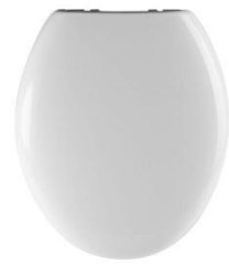
Kosy Soft Close