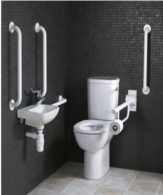
Doc M Close Couple WC Pack c/w White Rails