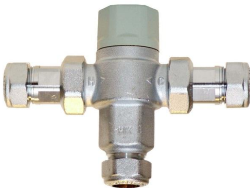
Titan TMV3 Mixing Valve