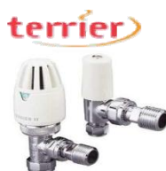
Pegler TRV & LS