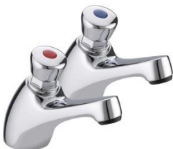
1/2" Non Concussive Basin Taps