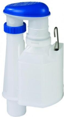
Round Internal Syphon