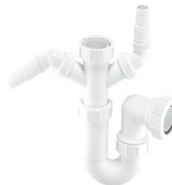
Sink Trap c/w 2 Conn