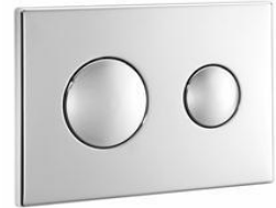
Contemporary Dual Flush Plate Unbranded for use with Conceala 2 Cisterns