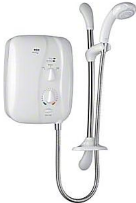
Code: ELITEST (Tank)