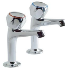
1/2" High Neck Sink Taps